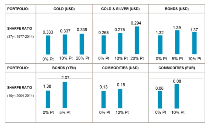
Figure 3: Platinum improves risk adjusted returns across a number of portfolios and across a number of currencies

Note: Selected results from analysis across several asset classes and currencies.