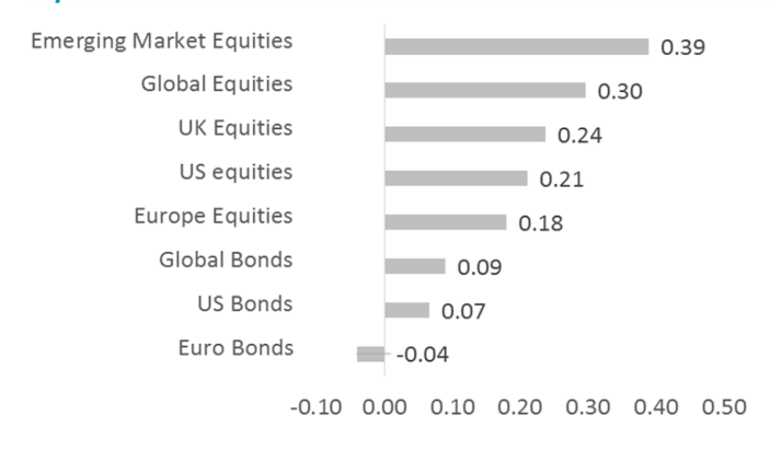
Figure 1: Platinum has a low correlation with equities and bonds

Note: Monthly return correlations back to 1998