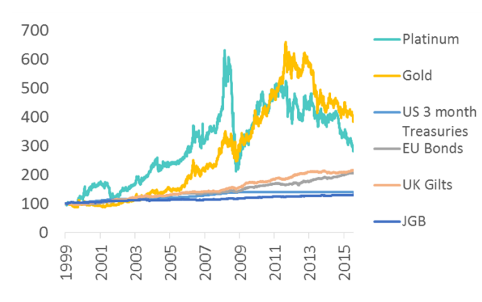
Figure 4: Despite recent price weakness platinum has outperformed most central bank reserve assets, excluding gold. Platinum has risen by 8% per annum on average since 1999

Note: Monthly return correlations back to 1998